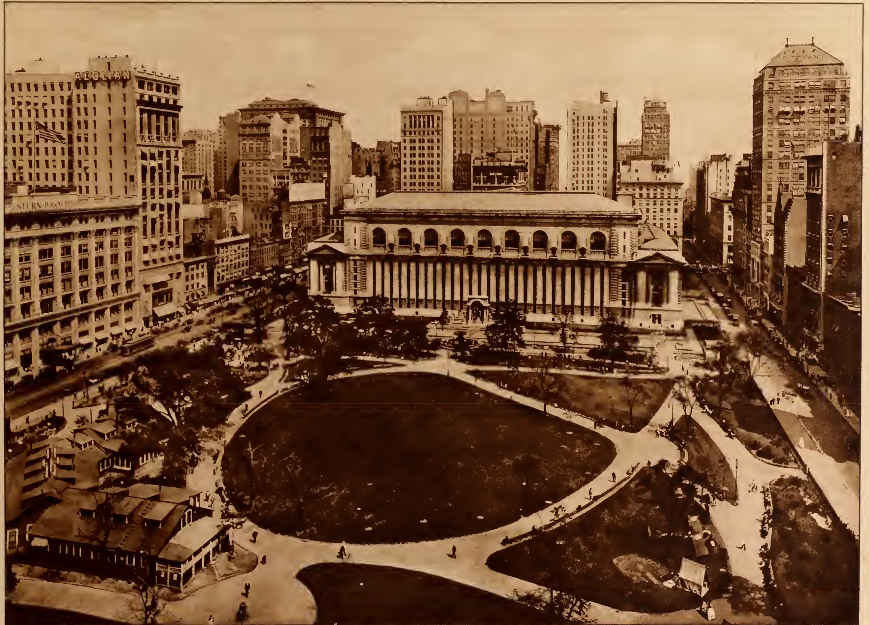
BRYANT PARK. Showing the rear view of the New York Public Library. This space is lined by department stores and skyscrapers. During the Revolutionary War it was the scene of spirited fighting. The canteen situated here was a popular meeting place for soldiers during the late war.